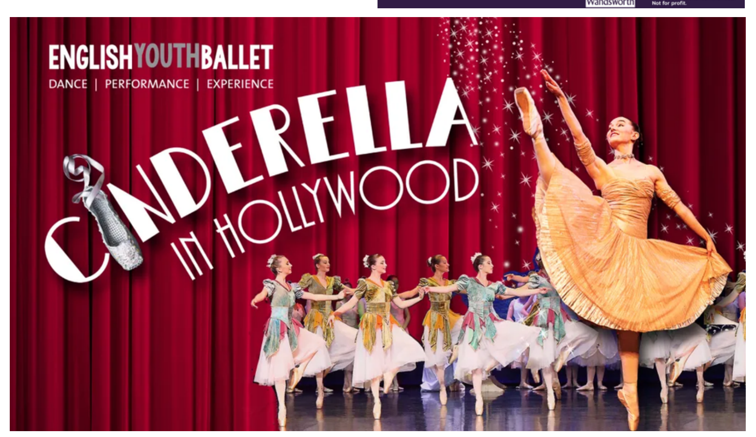
Friday 15th - Saturday 16th November 2024 New Wimbledon Theatre